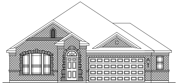
FRONT ELEVATION W/ OPT. 2 1/2 CAR