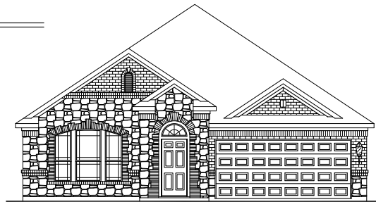
FRONT ELEVATION W/ OPT. STONE